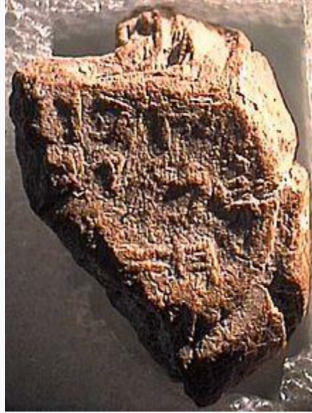
Stamped bulla of a servant of King Hezekiah used to seal a papyrus document

After Hezekiah became sole ruler in c. 715 BCE, he formed alliances with Ashkelon and Egypt , and made a stand against Assyria by refusing to pay tribute. [31] ( Isaiah 30–31 ; 36:6–9 ) In response, Sennacherib of Assyria attacked the fortified cities of Judah. ( 2 Kings 18:13 ) Hezekiah paid three hundred talents of silver and thirty talents of gold to Assyria – requiring him to empty the temple and royal treasury of silver and strip the gold from the doorposts of Solomon's Temple . ( 2 Kings 18:14–16 ) [31] However, Sennacherib besieged Jerusalem [32] ( 2 Kings 18:17 ) in 701 BCE, though the city was never taken.